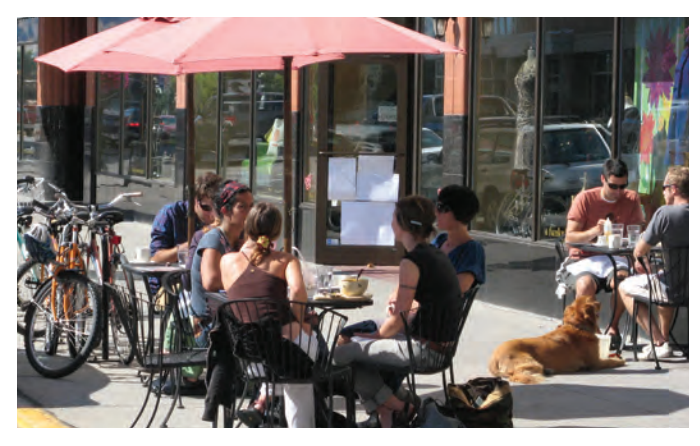
Example of "transparency" in downtown Missoula.