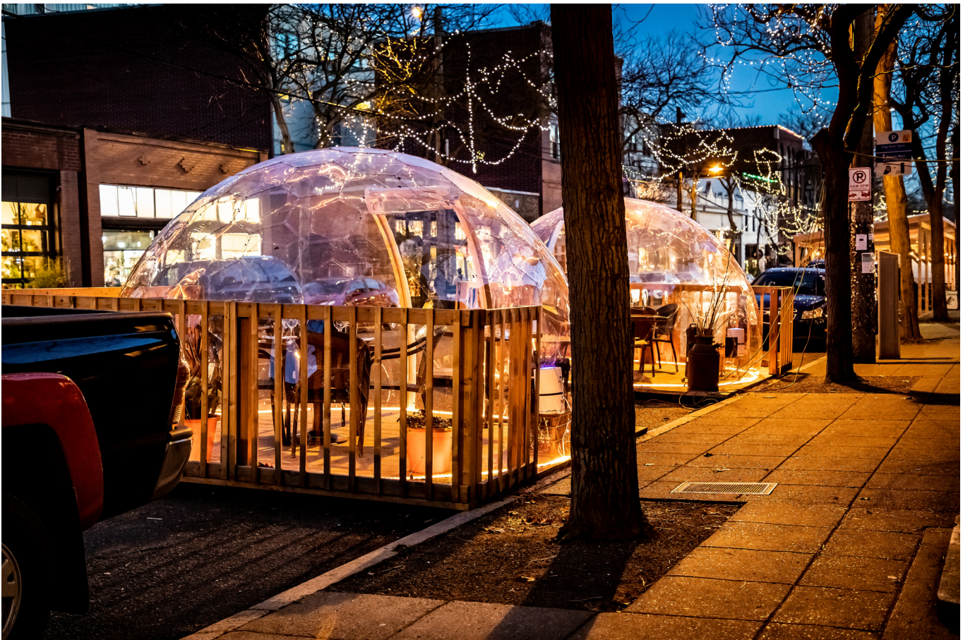
To stay afloat, restaurants across the country are experimenting with creative solutions to ensure safe and comfortable outdoor dining experiences.

For resources and updates, please visit mainstreet.org/mainstreetforward .